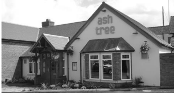
Ash Tree Pub

For Sat Nav Purposes please use WS15 1PU